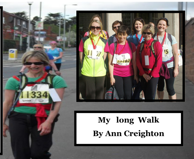
My long Walk By Ann Creighton

Good craic, good workout, what to loose 'only inches.'