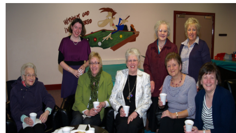
Ladies enjoying a cuppa at the PW Roadshow at Wellington Presbyterian Church Ballymena On the 20th of March 2010

Check-out the Church Library for more books to read over the Summer.